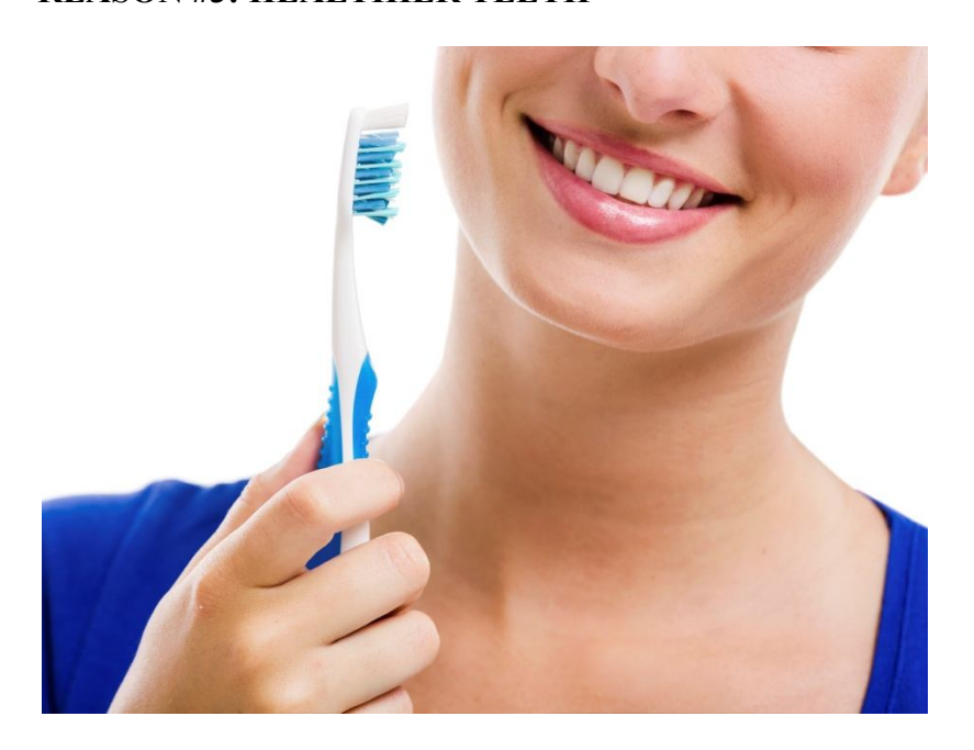
REASON #3: HEALTHIER TEETH

Keeping your teeth free of plaque is the best way of preventing diseases such as cavities, gum disease (gingivitis) and bone disease (periodontitis). Having crooked teeth creates areas that are difficult to reach and keep clean. This increases your chances of getting all these diseases.