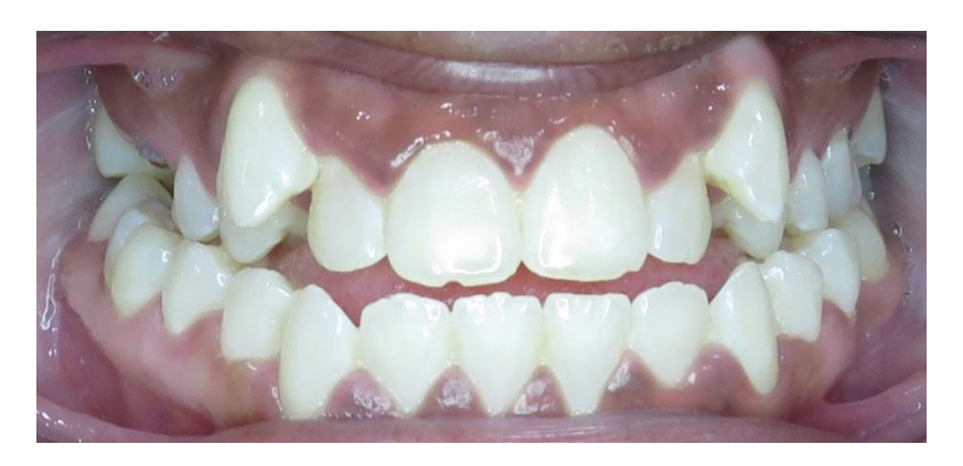
SIGN #4: OPEN BITE

An open bite is when the front teeth do not overlap each other. This is in many cases accompanied by the tongue being placed in between the front teeth.